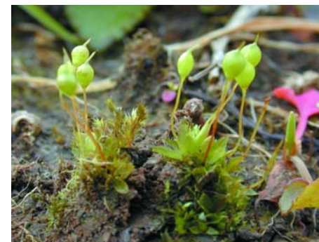
Common Bladder-moss Physcomitrium pyriforme MOSS