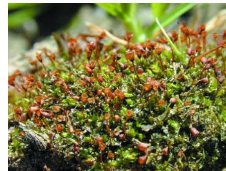
Common Pottia Tortula truncata MOSS

8 mm tall including sporophyte photograph × 3;