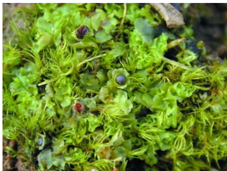
Common Frillwort Fossombronia pusilla LIVERWORT