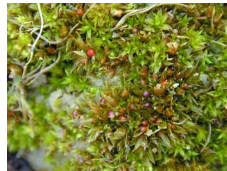
Cuspidate Earth-moss Tortula acaulon MOSS