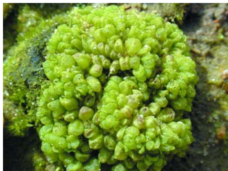
Texas Balloonwort Sphaerocarpus texanus HORNWORT