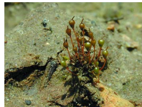
Hasselquist's Hyssop Entosthodon fascicularis MOSS

leafy stem 5 mm, sporophyte 5 mm: photograph × 3;