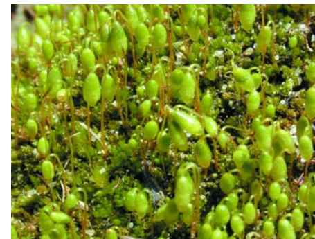
Bicoloured Bryum Bryum bicolor MOSS

leafy stem 5 mm, sporophyte 5 mm: photograph × 3;