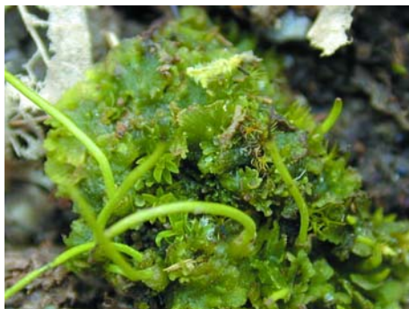
Field Hornwort Anthoceros agrestis HORNWORT