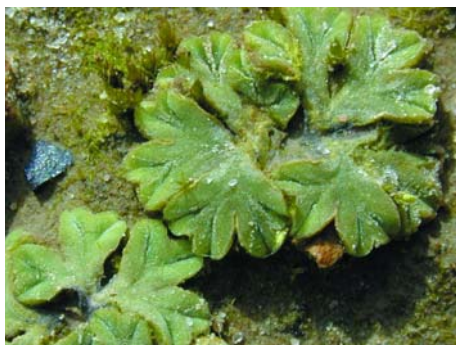
Common Crystalwort Riccia sorocarpa LIVERWORT